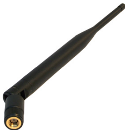
Multiple angle RP-SMA foot

RP-SMA connector compatible with 80% of all WiFi equipment.